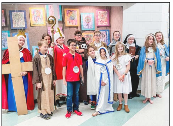
Saint Anne, Bristol