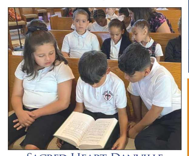
Sacred Heart, Danville