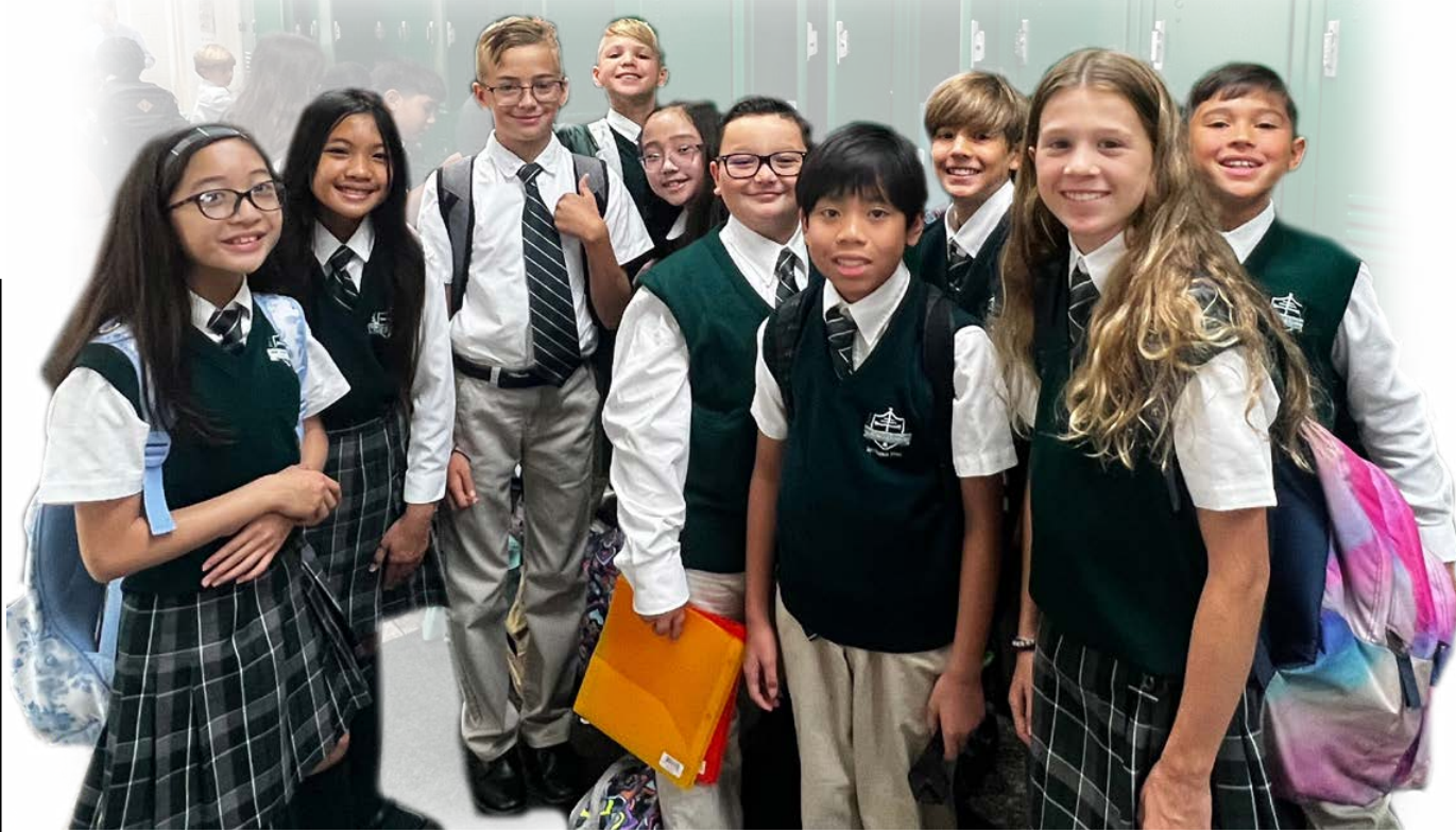
Saint Gregory the Great, Virginia Beach

Catholic school students are more likely to pray daily, attend church more often, and retain a Catholic identity as an adult. Catholic school graduates are more civically engaged, more likely to vote, more tolerant of diverse views, and more committed to service as adults/get involved in social advocacy.