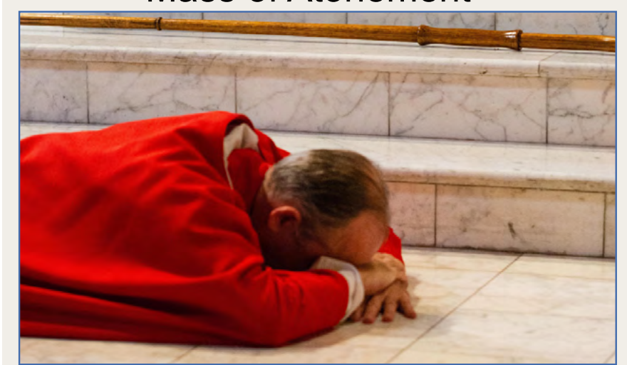
During the Mass of Atonement at the Cathedral of the Sacred Heart on Sept. 14, 2018, Bishop Knestout removes his episcopal ring, miter and crozier in an act of humility before lying prostrate before the cross.