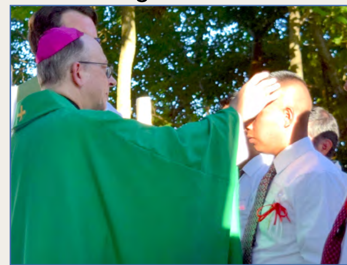
Bishop Knestout administers the sacrament of confirmation during a Mass celebrated for approximately 300 people at one of the 12 migrant camps on Virginia's Eastern Shore, Aug. 18, 2019.